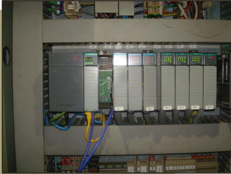
$350k PLC Upgrade $98k Backhoe